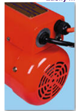
High torque torque motor